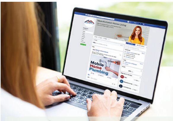
Do you want to continue receiving updates about our community? Follow us on Facebook to stay informed about the latest news! We will be posting articles, upcoming events, specials, and other community information.